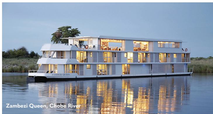
Zambezi Queen, Chobe River

Intra-Africa airfare incurs an additional $2,050 per person cost including taxes and fuel surcharges.