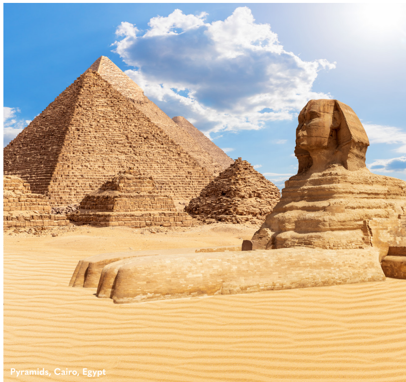
Pyramids, Cairo, Egypt