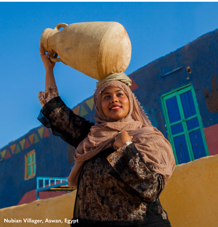
Nubian Villager, Aswan, Egypt