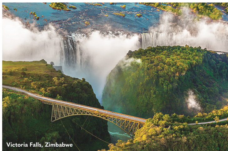
Victoria Falls, Zimbabwe