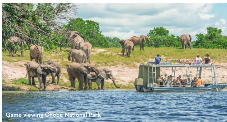
Game viewing Chobe National Park