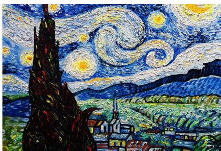
Trace the footsteps of Van Gogh