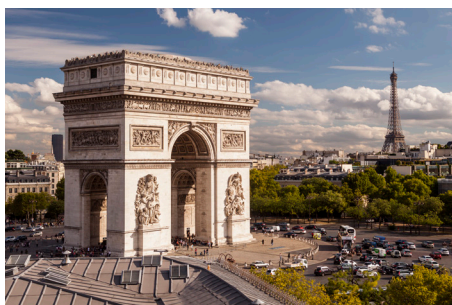
Arc de Triomphe, Paris, France